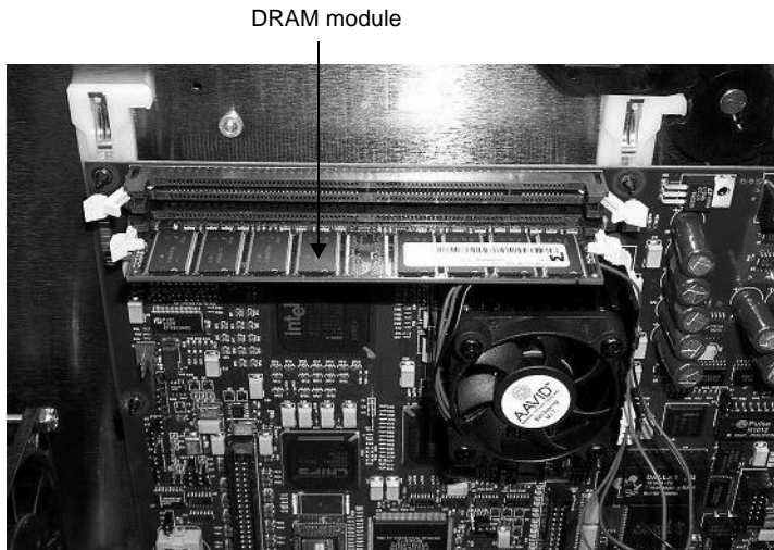
Figure 2: DRAM Module